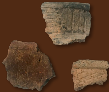
Decorated pottery sherds