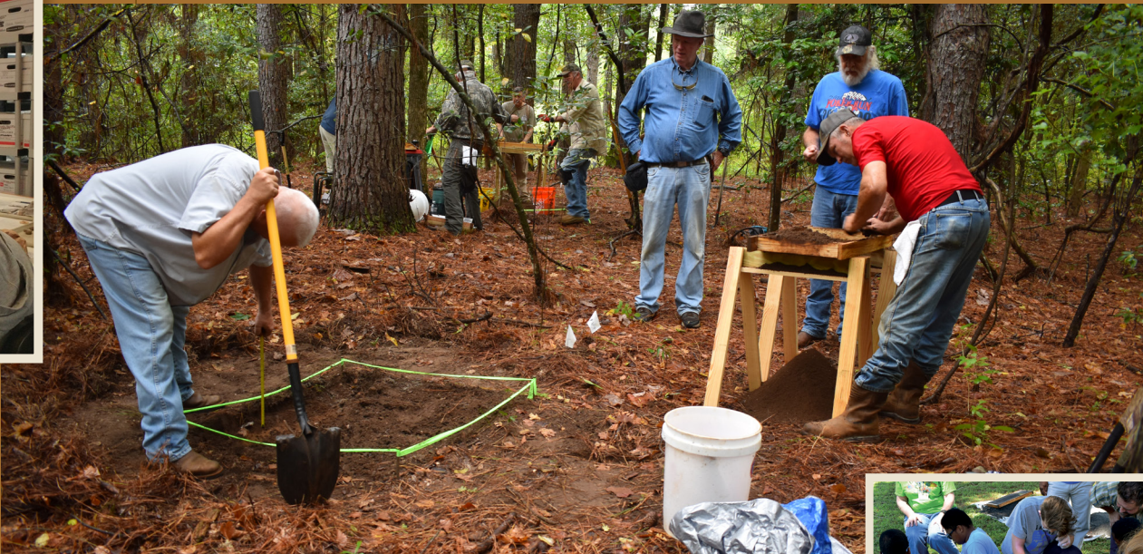
Local enthusiasts conduct field investigations with archaeologists at the Tom Field's site in Union parish.