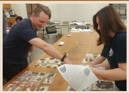
Volunteers attend workshops to learn how to interpret artifacts.