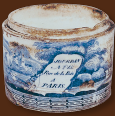
Mid-19th century French ointment jar