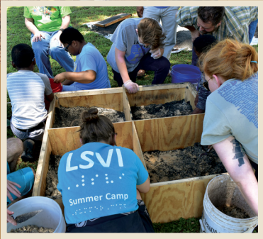
Louisiana School for the Visually Impaired students explore archaeology during summer camp.