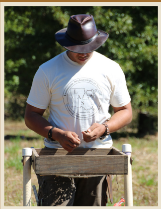
Volunteers look for artifacts by sifting through excavated soil at the Lac St Agnes mound site in Avoyelles Parish.