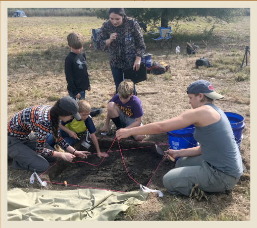
Students work alongside archaeologists to learn field techniques.