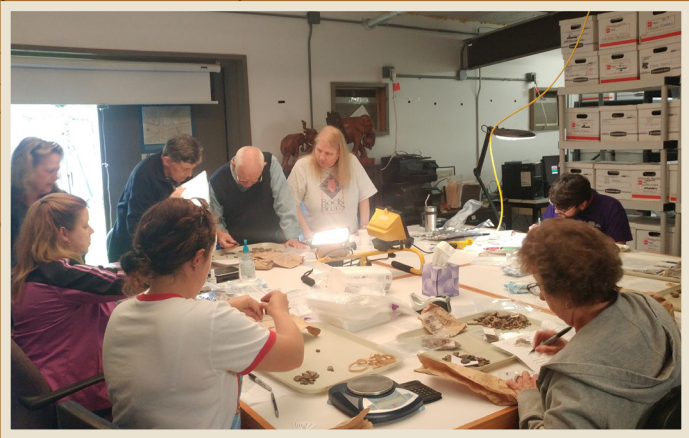
Volunteers sort and catalog artifacts from the Lac St. Agnes Mound site.