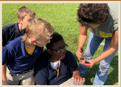
School children discover how archaeologists learn about the past.