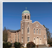
ANNUNCIATION CATHOLIC CHURCH