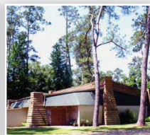
STUDIO IN THE COUNTY