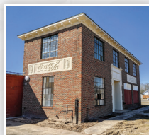
COCA-COLA BOTTLING PLANT