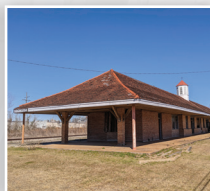
BOGALUSA TRAIN DEPOT