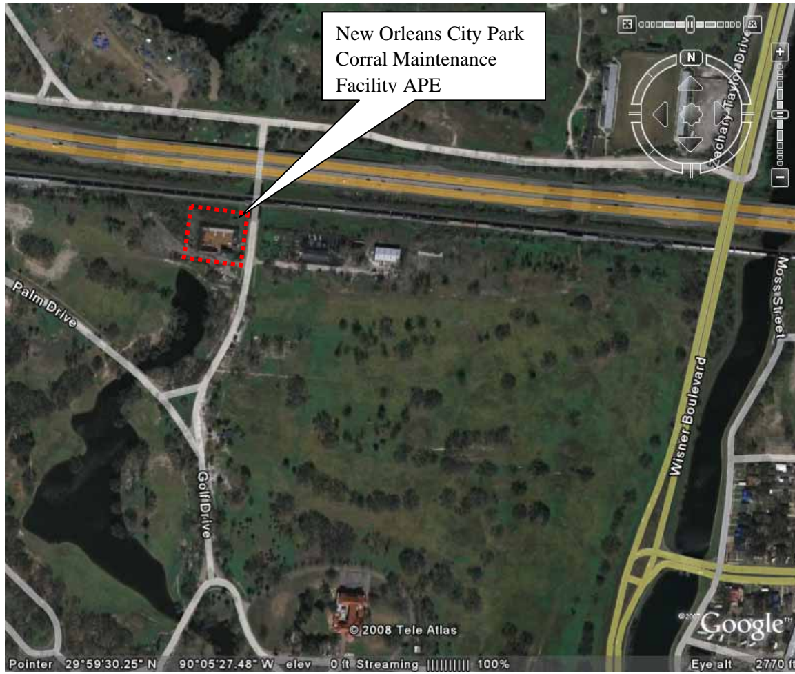
Figure 3. New Orleans City Park Corral Maintenance Facility Area of Potential Effect