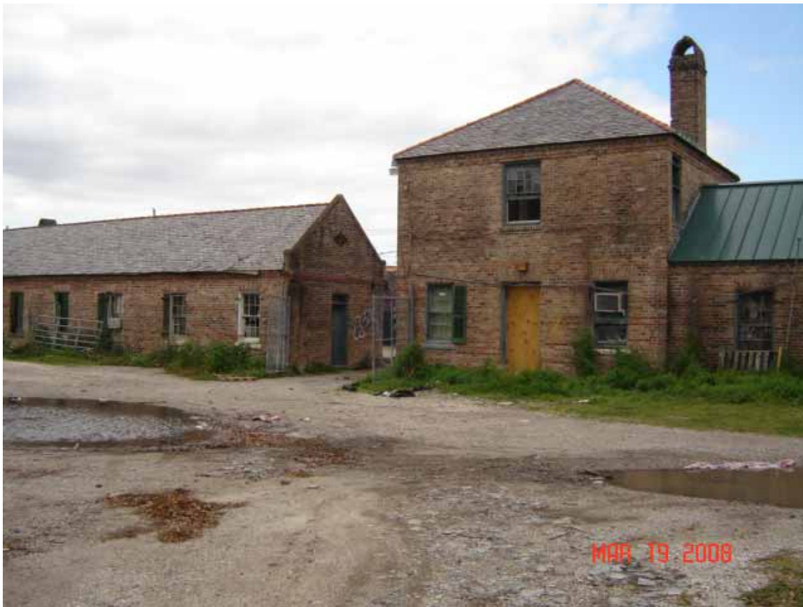
Figure 4. New Orleans City Park Corral Maintenance Facility, South Wing to be repaired