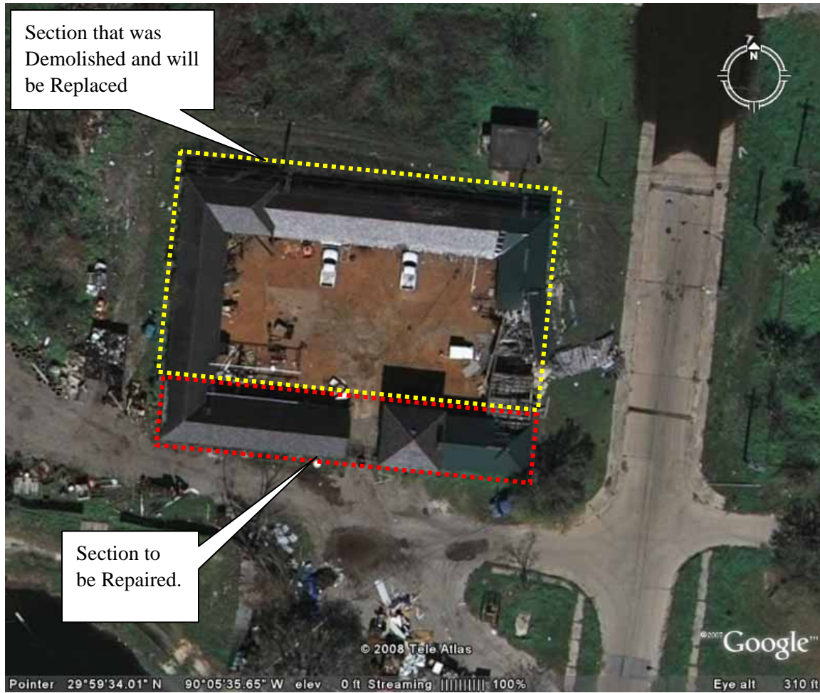
Figure 1. New Orleans City Park Corral Maintenance Facility.