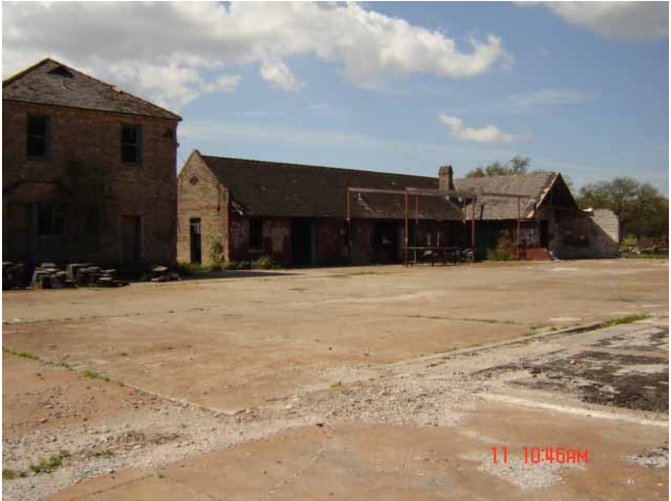
Figure 7. New Orleans City Park Corral Maintenance Facility, South Wing and Courtyard.