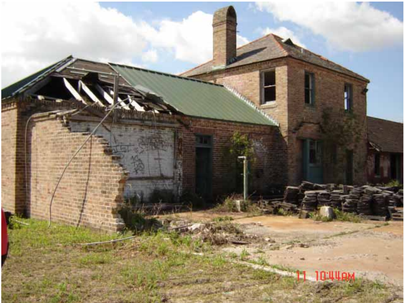
Figure 6. New Orleans City Park Corral Maintenance Facility, Courtyard view of South Wing to be repaired.