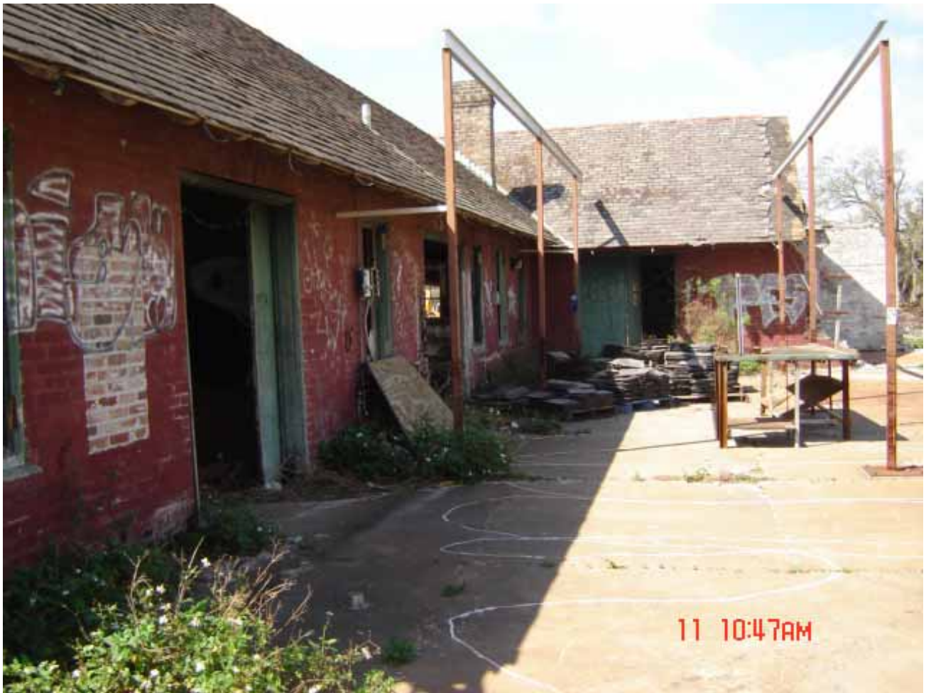
Figure 5. New Orleans City Park Corral Maintenance Facility, Courtyard view of South Wing to be repaired.