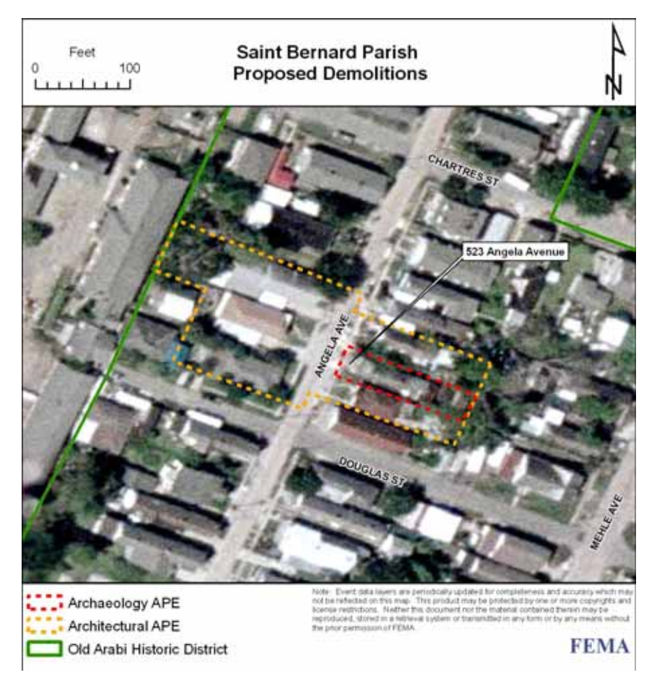
Figure 1. 523 Angela Avenue. Location and APE in relation to Old Arabi Historic District NRHP boundary.

523 Angela Avenue, Arabi Contributes to Old Arabi Historic District 29.95237677, -90.008059 Condemned by Parish