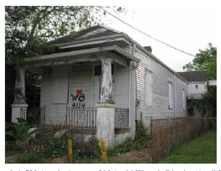
Photograph 1. 523 Angela Avenue, Old Arabi Historic District (April 27, 2009).