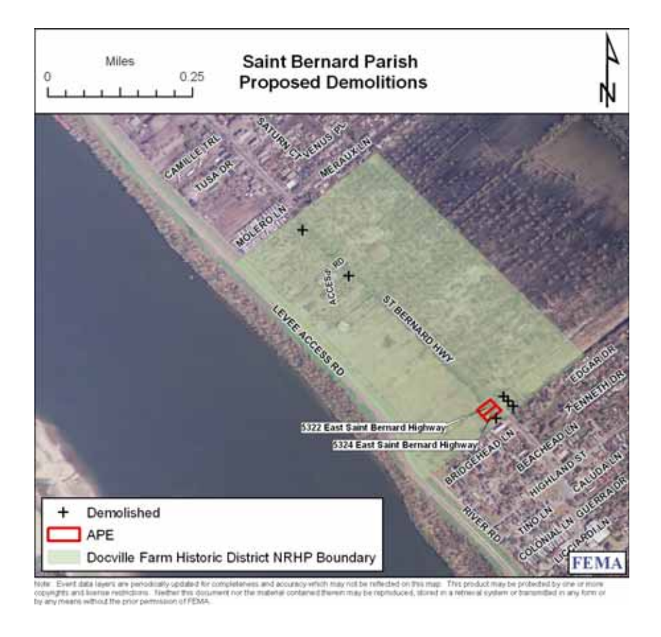
Figure 1. Overview of Docville Farm Historic District, showing NRHP boundary and locations of 5322 and 5324 East St. Bernard Highway (both proposed for demolition).