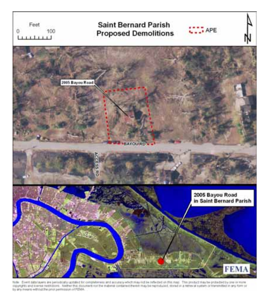
Figure 1. 2005 Bayou Road. Location and APE.