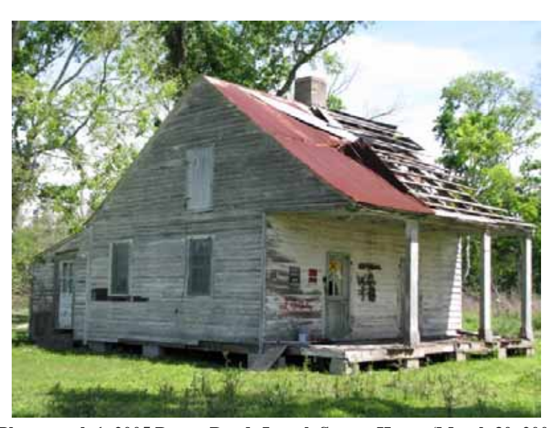
Photograph 1. 2005 Bayou Road, Joseph Serpas House (March 30, 2009).