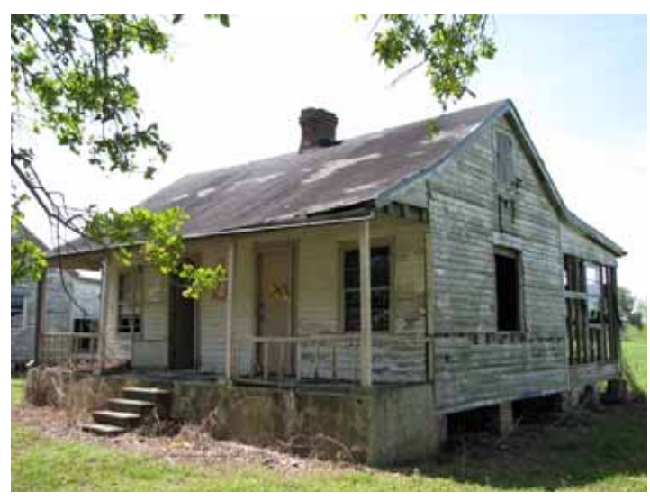
Photograph 1. 5322 East St. Bernard Highway, Docville Farm Historic District (March 30, 2009).