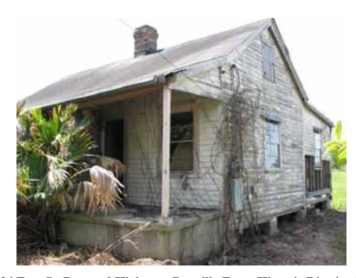
Photograph 1. 5324 East St. Bernard Highway, Docville Farm Historic District (March 30, 2009).