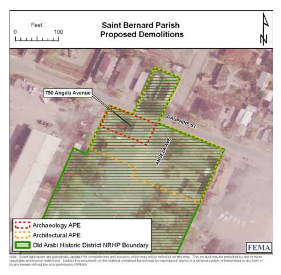
Figure 1. 750 Angela Avenue. Location and APE in relation to Old Arabi Historic District NRHP boundary.

750 Angela Avenue, Arabi Contributes to Old Arabi Historic District 29. 954822504, -90.007289084 Condemned by Parish