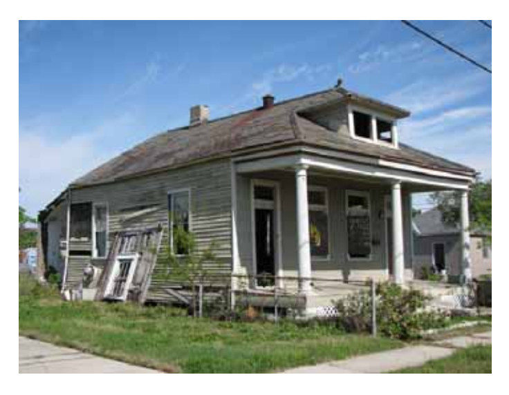
Photograph 1. 750 Angela Avenue, Old Arabi Historic District (March 30, 2009).